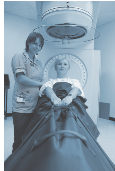
Safe Sit™ is protected by UK patent GB2428195 and a Community Design Registration 000385158-0002

As a licensed product developed in collaboration with the NHS a proportion of Safe Sit™ income will help fund development of future NHS products.